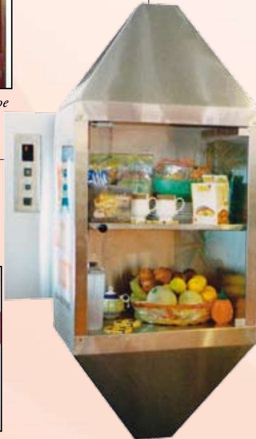
Capsule - Open Type