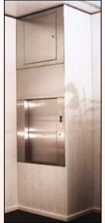
Vertical Bi-Parting Doors